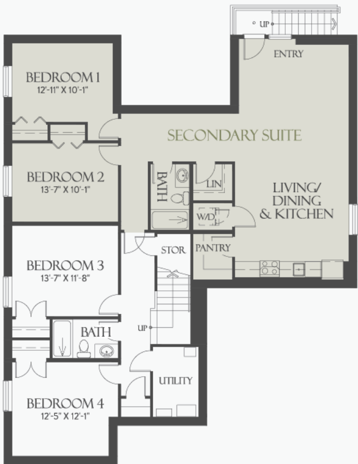
LOWER 1,869 SF