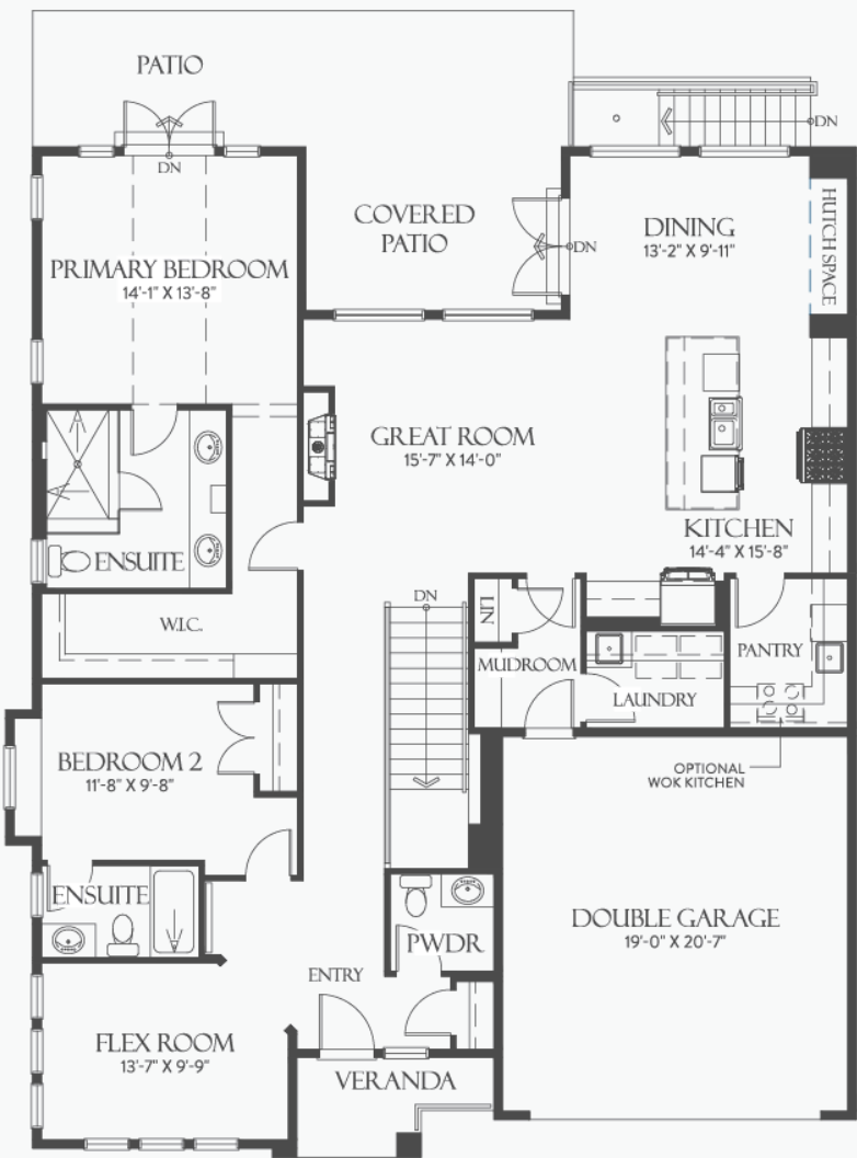
MAIN 1,878 SF